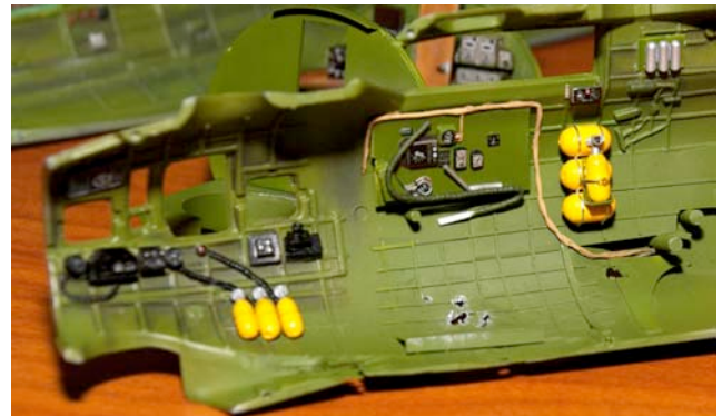
The detailed right sidewall of Tom's B-17's cockpit.

Tom Sixby had another installment of his Monogram 1/48 B-17G to show us. This one has all of the interior detail in place from the glass nose to the tail gunner's position, and it is amazingly detailed.