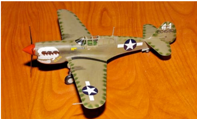
Stan's 1/48 Mauve Warhawk, built as a P-40N-1.

And, we seem to be having a run on completed