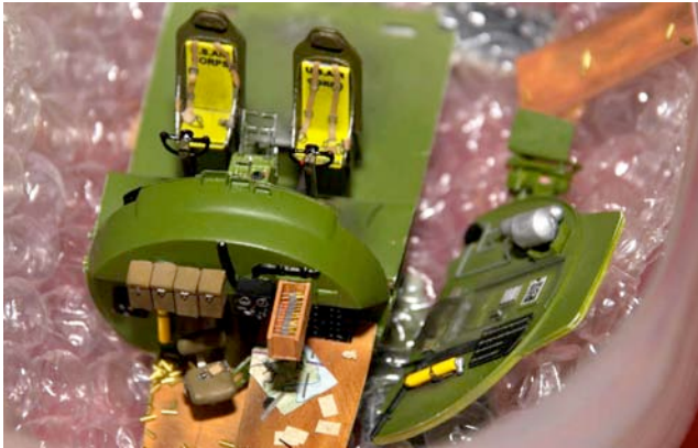
More of the cockpit details in Tom's B-17.

never being seen again. So, we recommend that everyone check everything out now before it's too late!