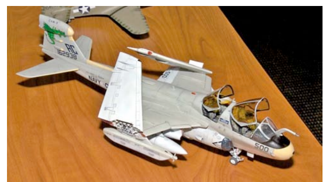
Ross's big Revell 1/48 EA-6B was impressive.

aftermarket provider of that particular conversion kit. So Ross was left to his own devices to drill some holes and bend piano wire to make his own invisible