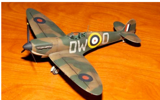
Anthony had a pair of B of B fighters on hand.

since both were built to be eligible for the 'Battle of Britain' theme at the contest, they were painted in the standard RAF dark green/dark earth over sky scheme. We liked the fact that Anthony did not paint the two British fighters in the exact same shades of green and brown, but varied the shades just a bit to promote a more realistic scenario. Of course, he said that the Tamiya kit was the easier build of the two. Hasegawa usually makes a kit with fuselage and wing inserts to improve the 'mileage' they get out of a set of molds