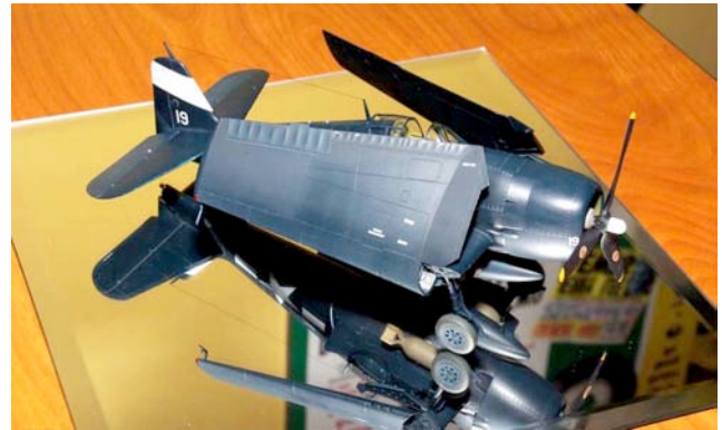
Roger's Hobby Boss F6F featured folded wings.

built by Roger Razor for the IPMS Reviewer Corps. We say that about the scale because the model looks like a 1/48 Hellcat with a cockpit section scaled at about 1/40 grafted into the center of it! Luckily, the folded wings hide this part from most viewing angles, so the effect is reduced somewhat. The finished model was certainly well made and painted, but we think the kit represents a 'what were they thinking?' moment for those at HobbyBoss!